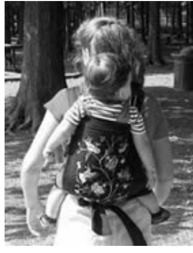
6a - Tied over baby's legs.