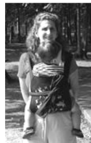
5b - Tied behind baby's back.