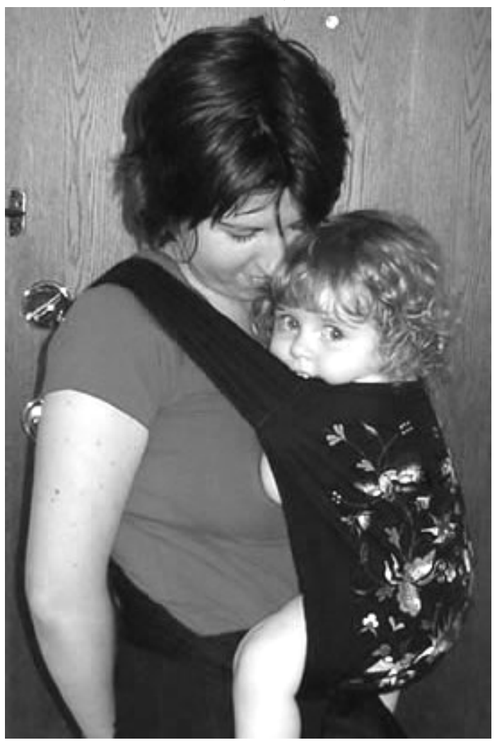
~Embroidered Chinese (Miao) Mei Tai