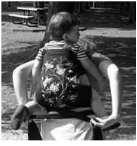
5b - Crossed under baby's legs.