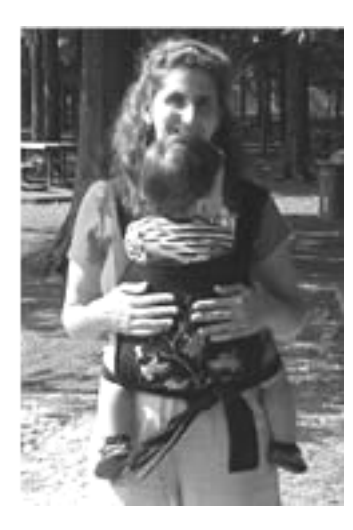
5a - Tied over baby's legs.

**Secure the Mei Tai straps with a square knot (double knot).**