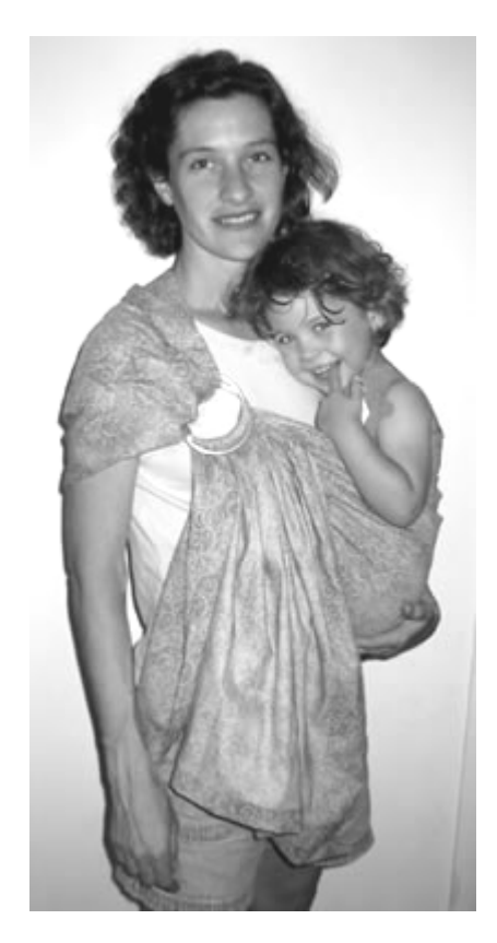
Hip Carry (after head control)

This position will last you from head control through "too heavy"! It is truly the workhorse position of the baby sling.