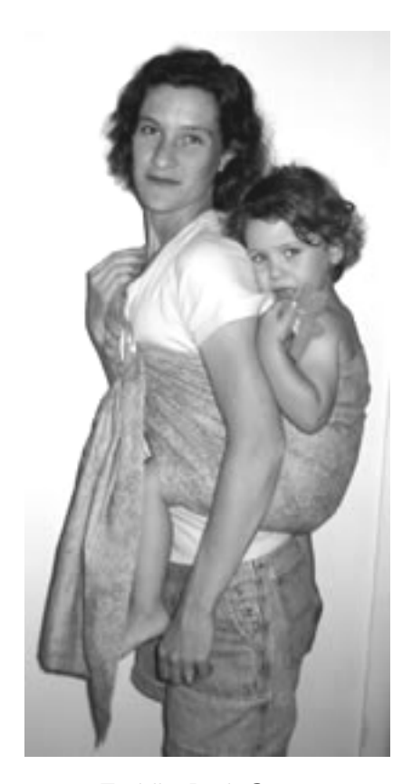
Toddler Back Carry (1 year & up)

This position is best for short periods of time, to keep prying hands away from interesting business (e.g. your checkbook, at the grocery store).