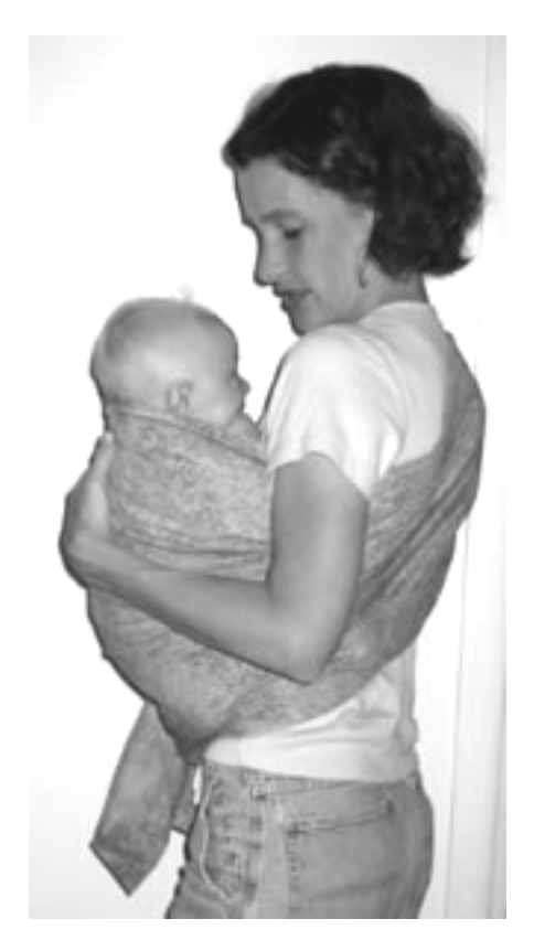
Infant Tummy Carry (infant)

Sometimes newborns look "smooshed" in the cradle hold. This is generally more of a concern to the parent than to the child. If he's uncomfortable, he will let you know. If you would like more structure for a newborn, you can fold a receiving blanket and place it in the bottom of the sling, under baby.